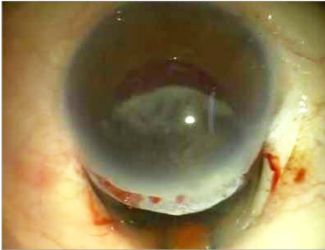
FIGURE 3. ECCE – removing of the nucleus through 11 mm incision.