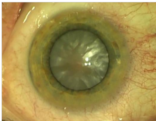
FIGURE 2. Mature cataract.